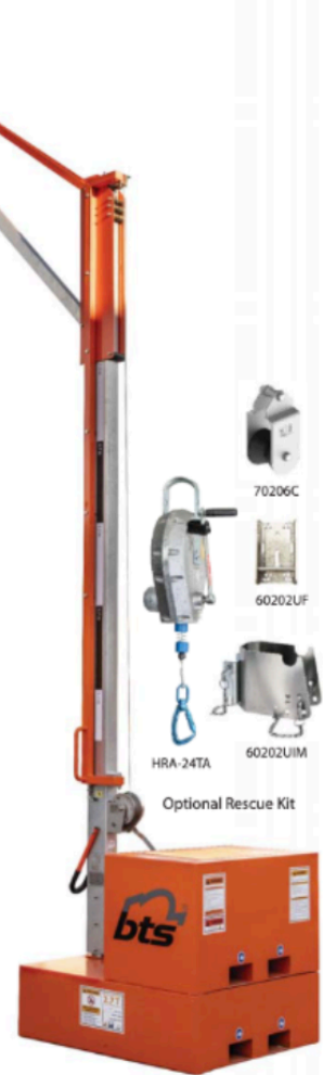
Easily moved with forklift or pallet truck