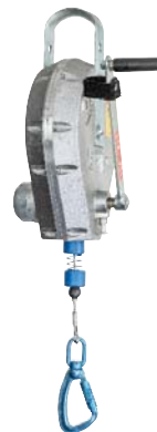
HRA-12TA HRA-18TA / HRA-24TA